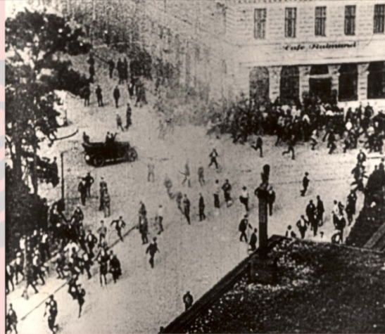
A street fight between Nazis and Communists in Berlin in 1929.